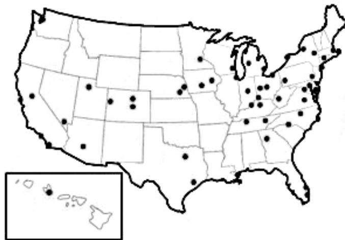
Figure 1. Orkin's top 50 bedbug cities in the United States in 2011. 5

pests, the explanation for their booming resurgence from a period of relative rest and eradication starting in the 1950s remains unclear. 7,8